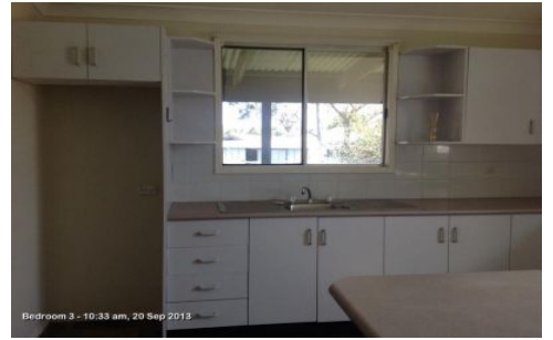
Bedroom 3 - 10:33 am, 20 Sep 2013