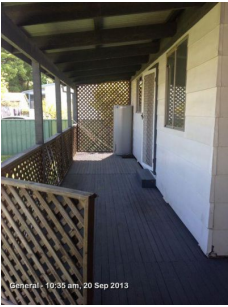
General - 10:05 am, 20 Sep 2013