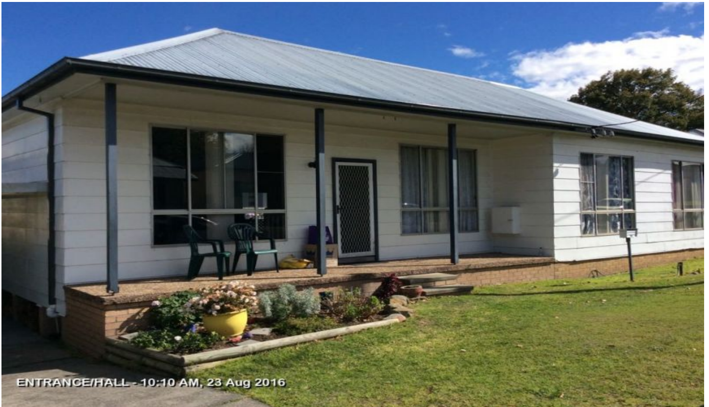
ENTRANCE/HALL - 10:10 AM, 23 Aug 2016