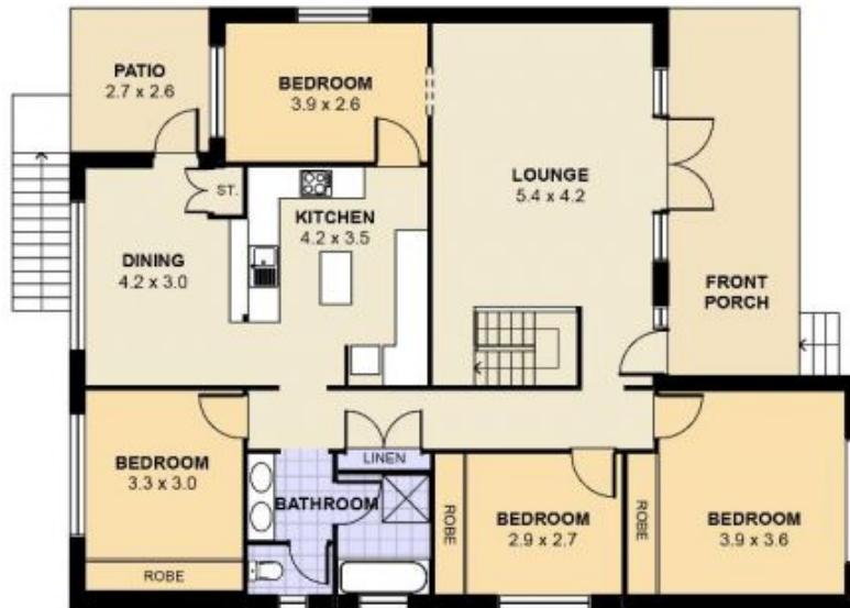
STREET LEVEL FLOOR PLAN