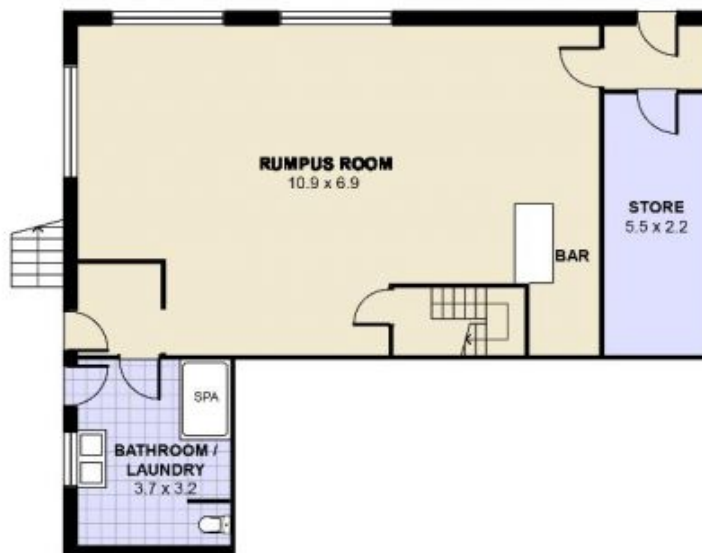
LOWER LEVEL FLOOR PLAN