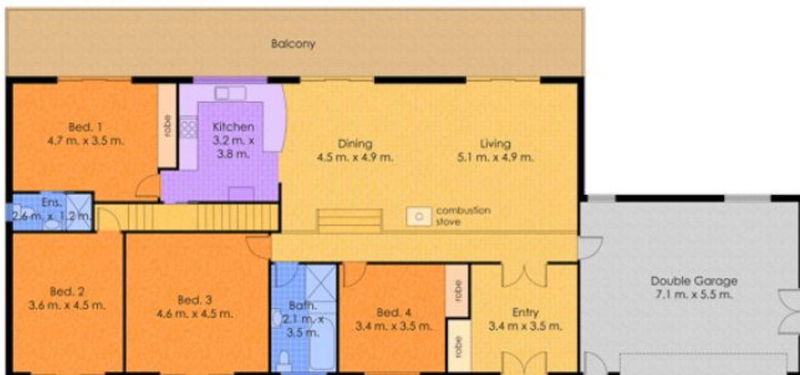
Upper Level Floor Plan Total Internal Floor Area: 285 sqm