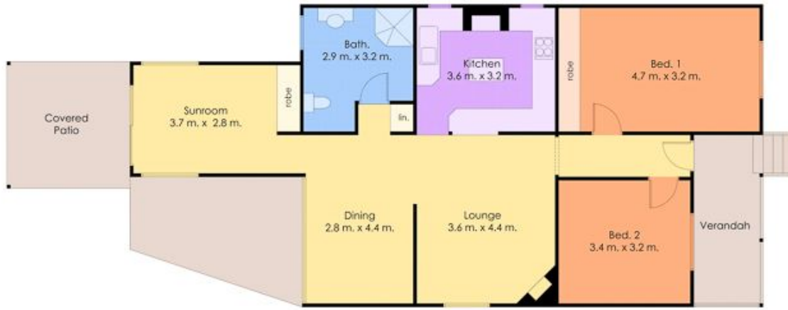
Floor Plan Total Internal Floor Area: 94 sqm