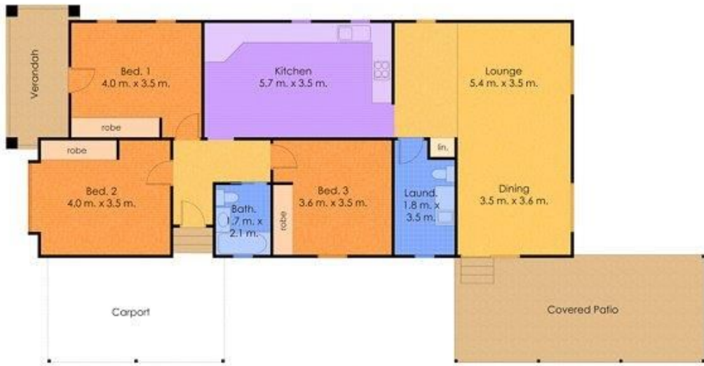
Floor Plan Total Internal Floor Area: 108 sqm