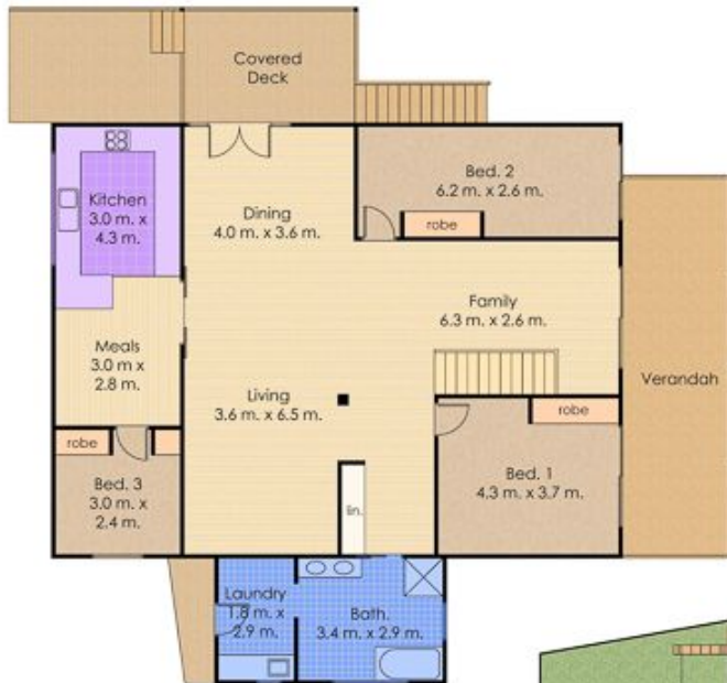
Upper Floor Plan Total Internal Floor Area: 200 sqm