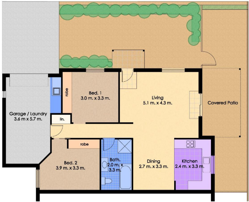
Floor Plan Total Internal Floor Area: 93 sqm