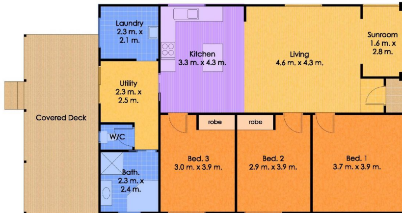
Floor Plan Total Internal Floor Area: 96 sqm