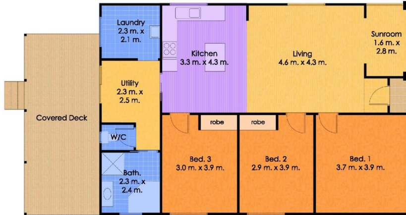
Floor Plan Total Internal Floor Area: 96 sqm