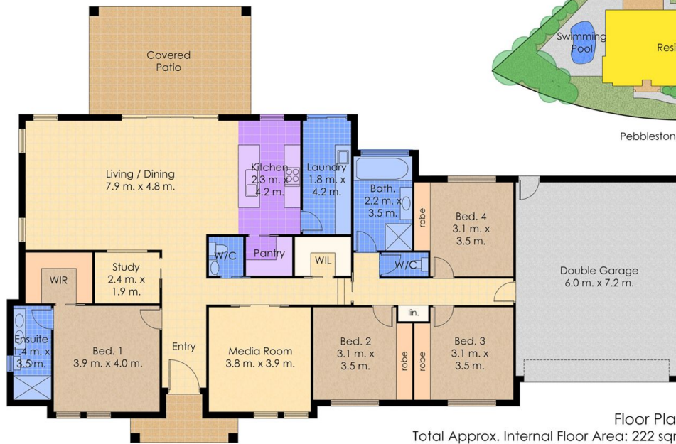
Floor Plan Total Approx. Internal Floor Area: 222 sqm