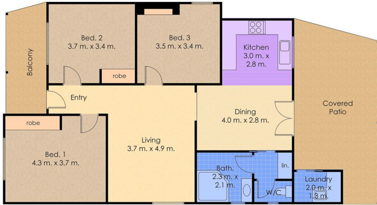
Floor Plan Total Approx. Internal Floor Area: 141 sqm