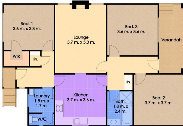
Floor Plan Total Internal Floor Area: 96 sqm