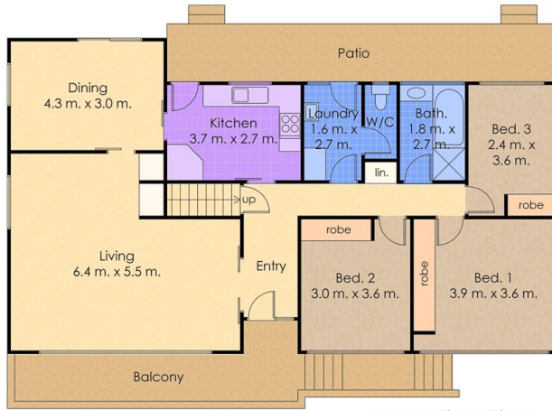
Upper Floor Plan Total Approx. Internal Floor Area: 165 sqm