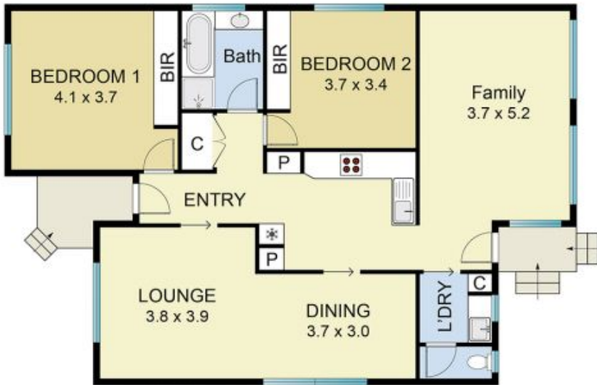
Internal 100m2 approx