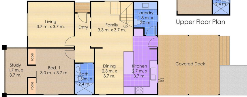
Lower Floor Plan Total Approx. Internal Floor Area: 125 sqm